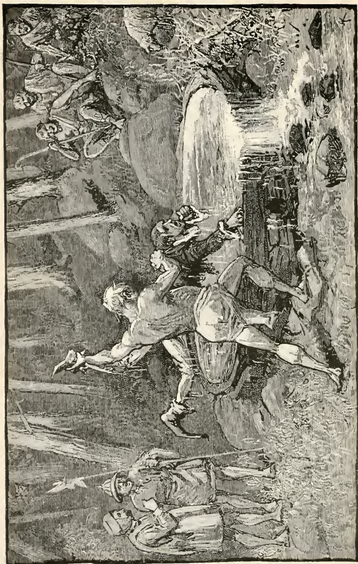
How Sir Tristram soused Sir Dagonet in the Well.